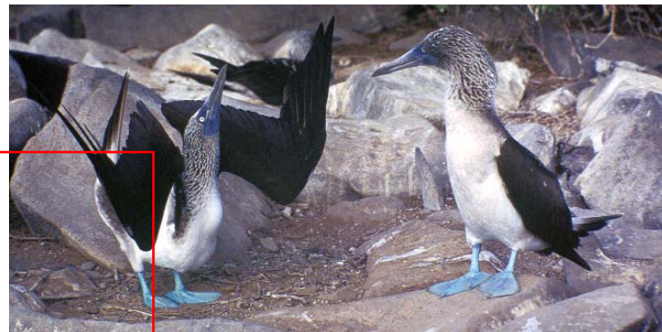
Behavior ritualized into a signal. The sky-pointing courtship display of the blue-footed booby ( Sula nebouxi ) seems to have been derived from flight intention movements.

In the final chapter, the authors discuss signaling in primates and some other social vertebrates. Here we find several topics that border on other fields such as psychology